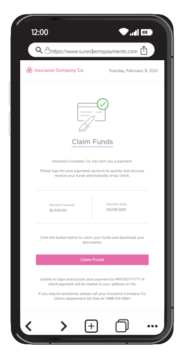
2: Selects their desired payment method